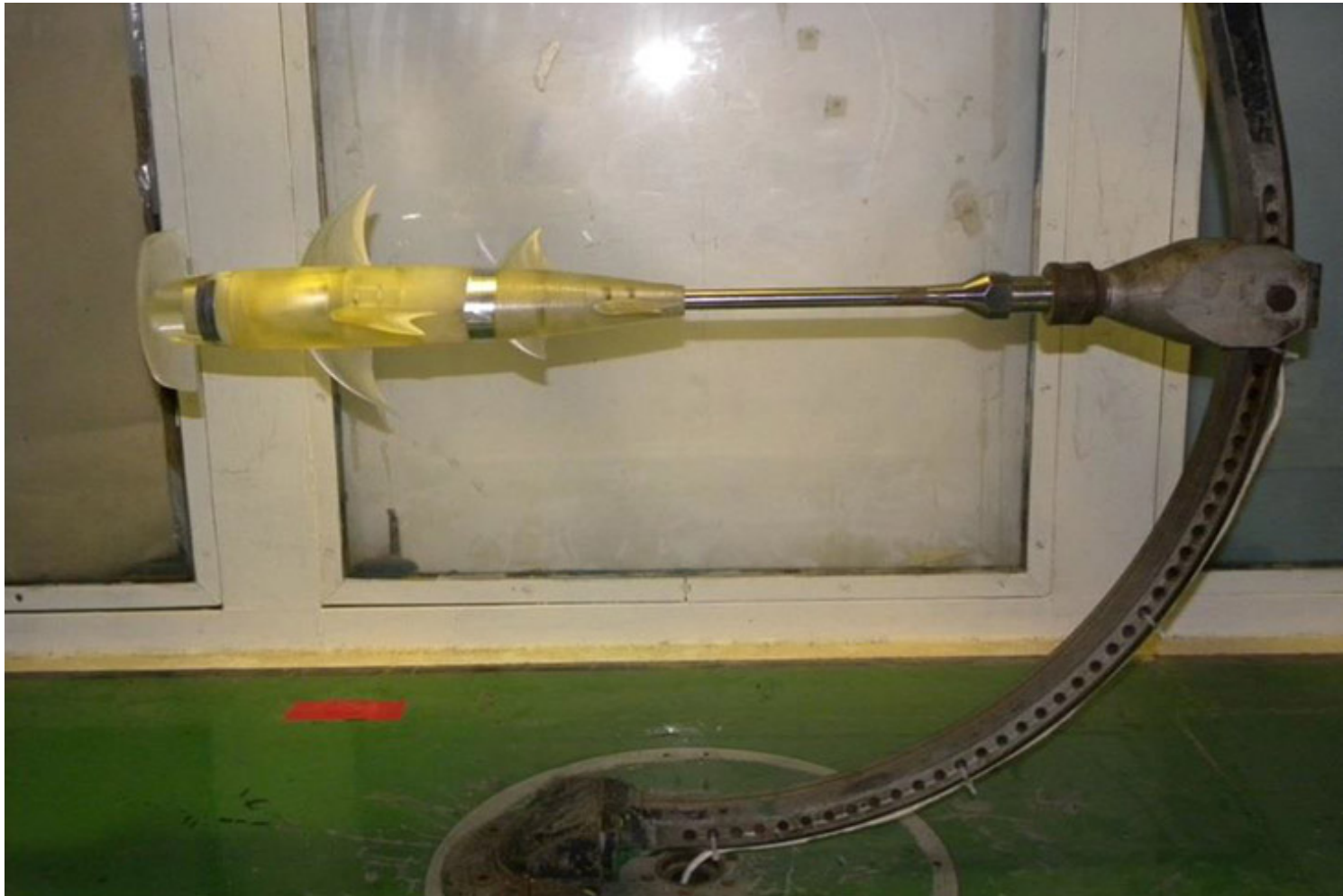
Figure: A shark model in a wind tunnel